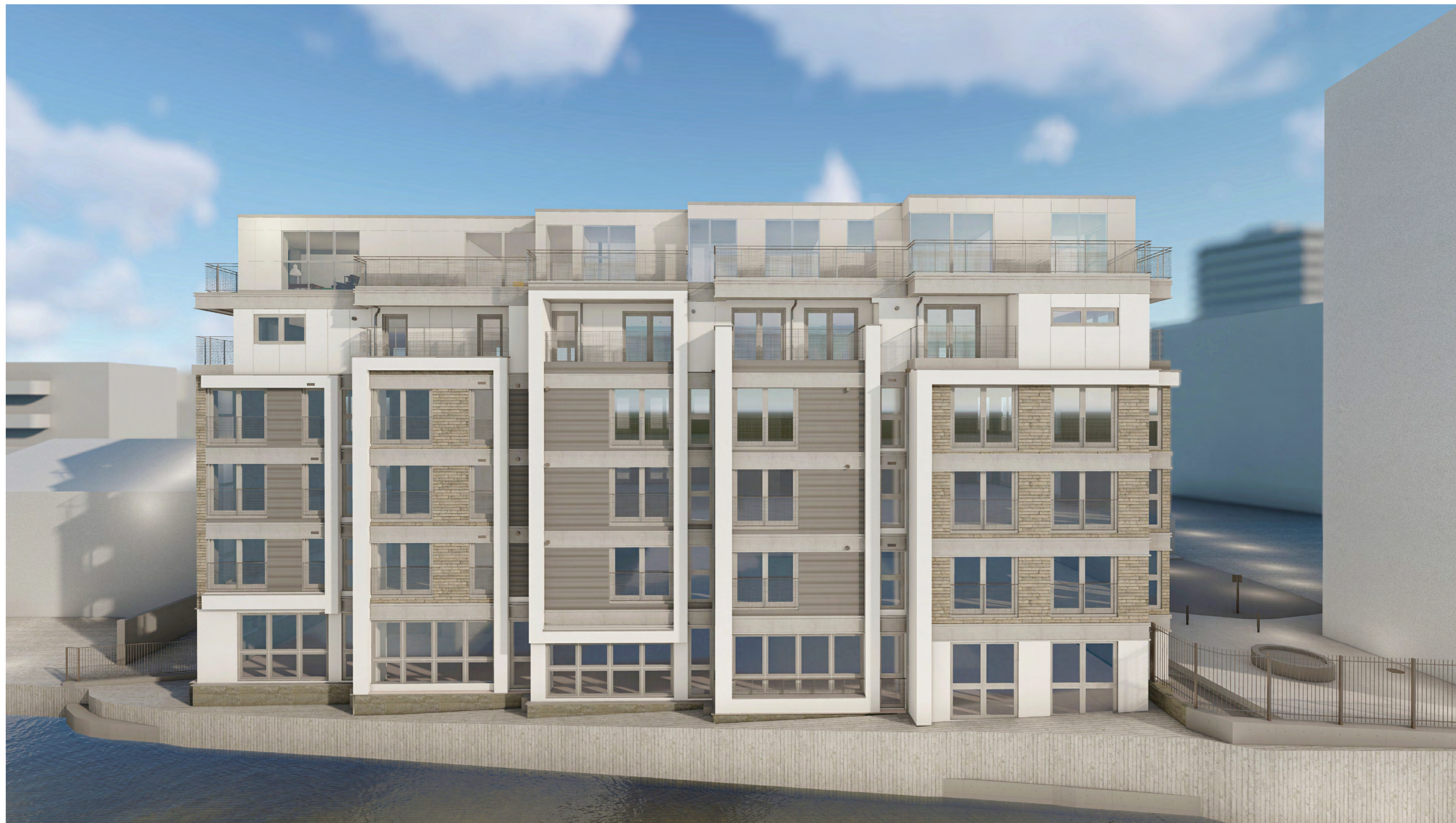
② Canal view - Equitone panels finish alternative