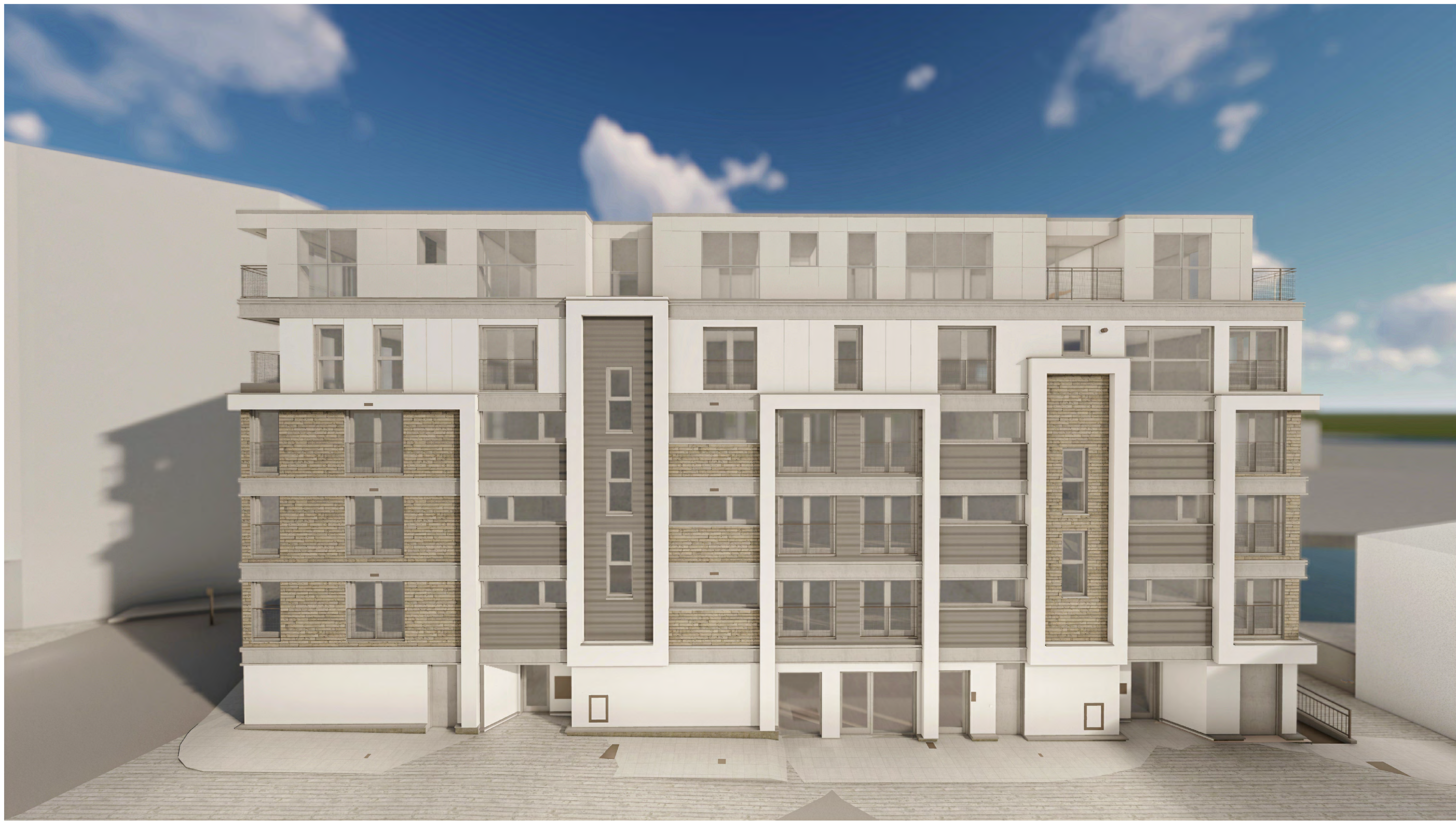
② Street view - Equitone panels finish alternative